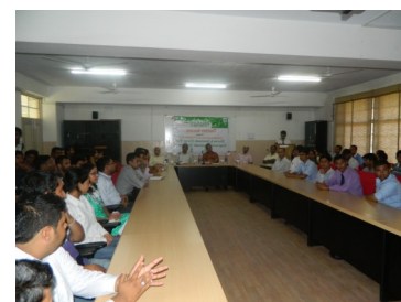
Vice Chancellors of CUHP & Tripura University Attending the Valedictory Function on Tourism Week

30th & 31st October 2012 for the Department of Journalism & Creative Writing and 1st and 2nd November 2012 for the Department of Mass Communication & Electronic Media. The appointment of faculty in both the departments that fall under School of Journalism, Mass Communication & New Media will give additional impetus to the functioning of the School.