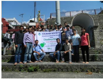
Cleanliness Drive on the occasion of Tourism Week