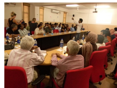
The Visitors handing over Gifts to students of CUHP