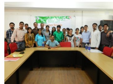
Participants of the Tourism Week Celebrations

The officials who handled these interviews did a commendable job to arrange for the dates and timings of the interviews, as also for doing all the paper work and scrutiny of the applications of candidates. Screening of the applications which was received in large numbers was a herculean task. Hopefully the best available intellectual resources would be joining the university and take it to new heights in terms of academic growth and research.