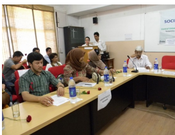
International Team's Visit to CUHP

upon its working with regard to the previous year's statement of receipts and expenditure, the balance sheet as audited and the budget for the next financial year. The Court is vested with the powers to review the acts of the Executive Council and Academic Council and to exercise the powers of the University not otherwise provided in the Act or the Statutes.